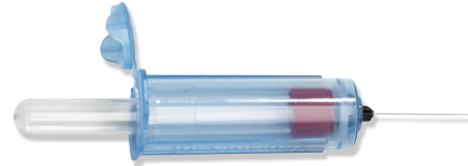
VanishPoint® Blood Collection Tube Holder